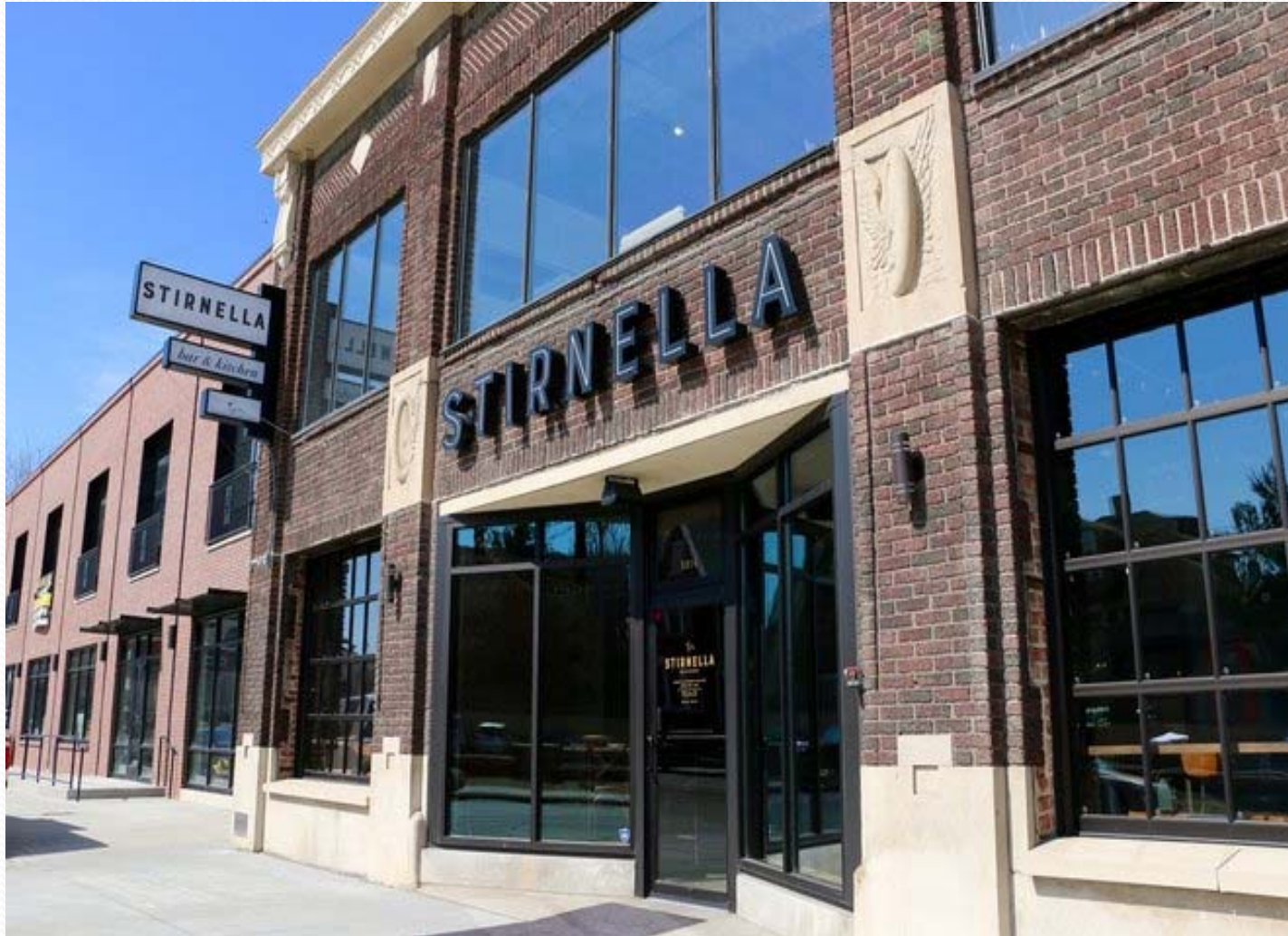
Firestone Bldg. - 3814 Farnam