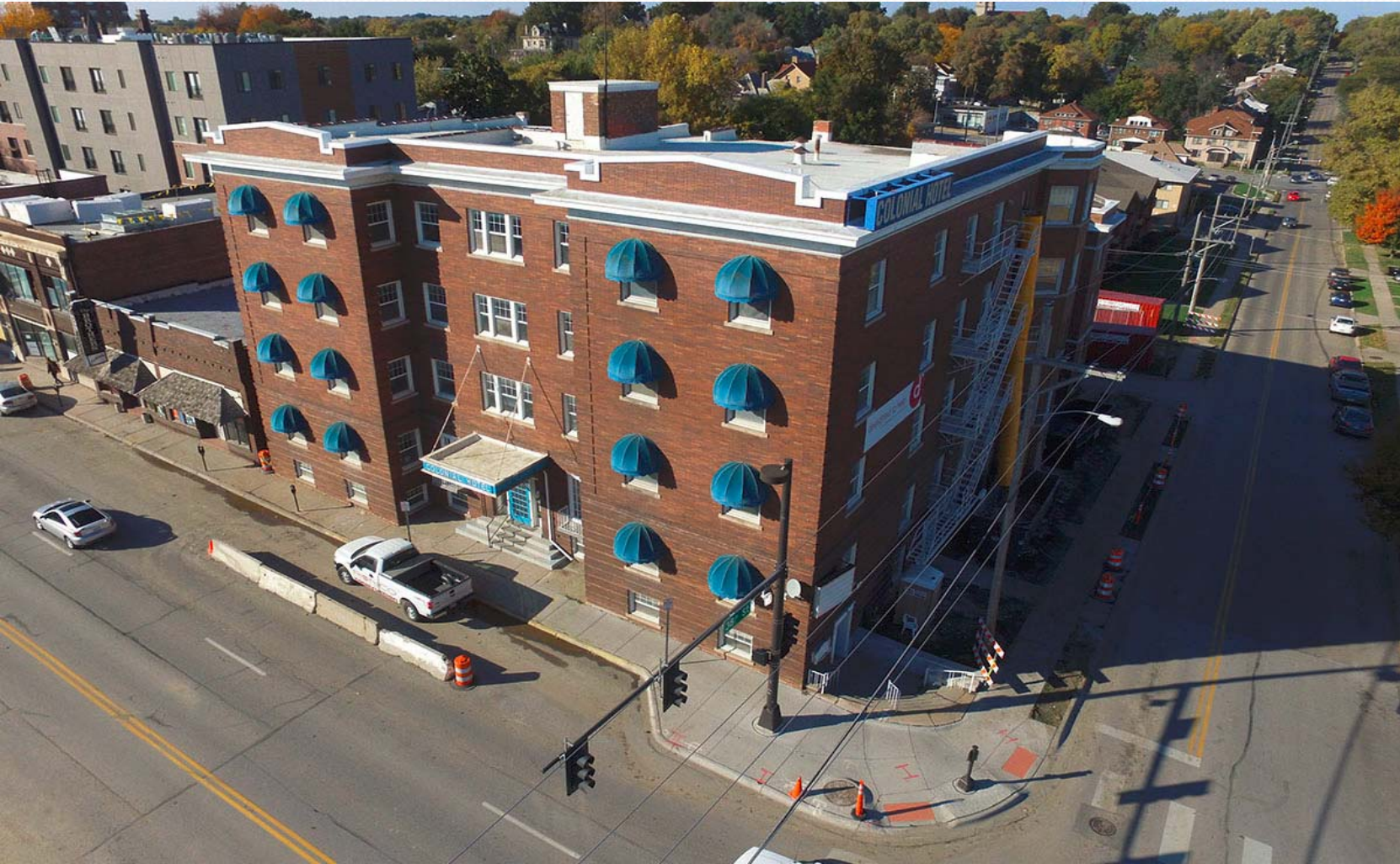
Colonial - 38 th & Farnam