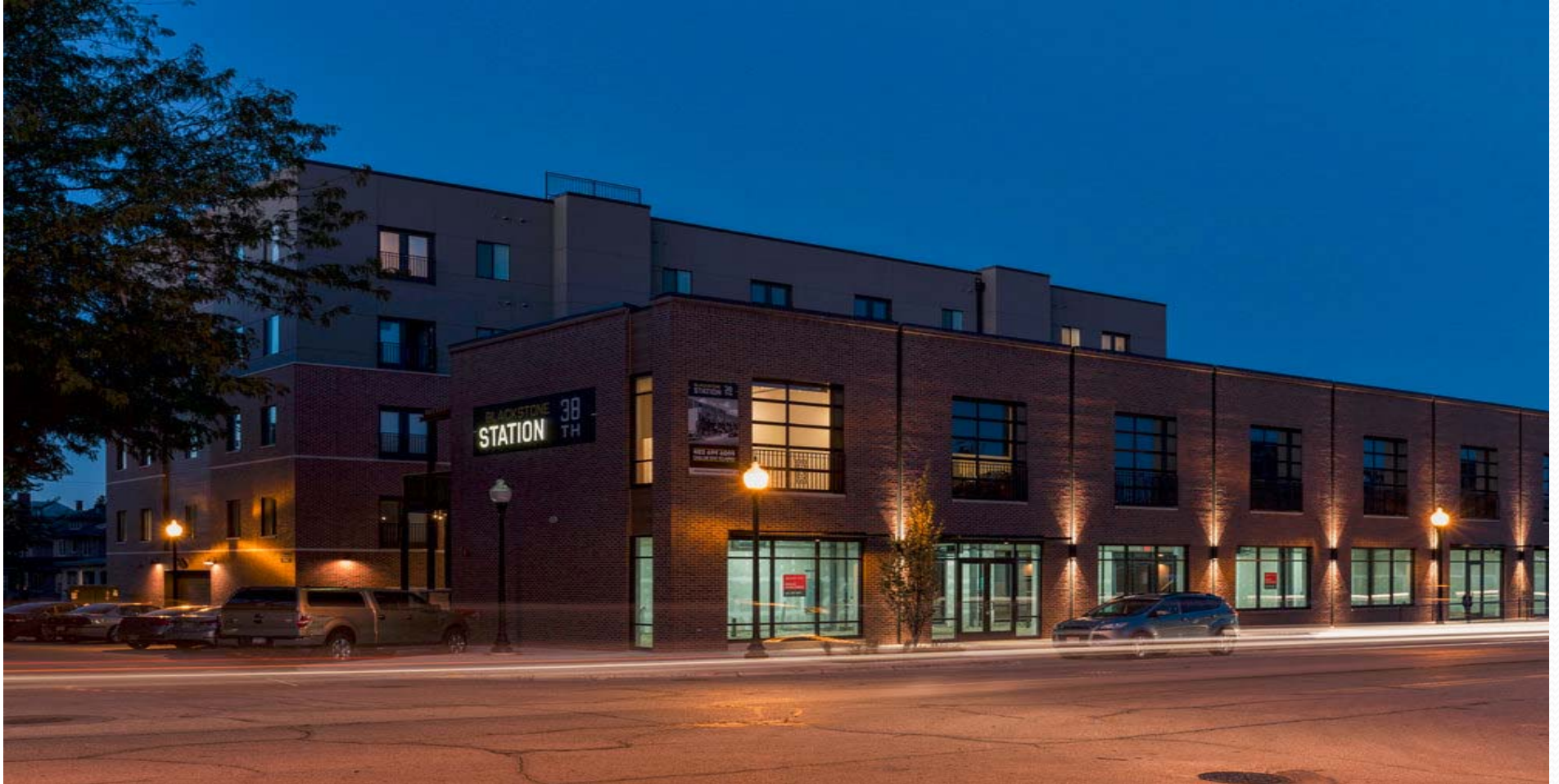
Blackstone Station – 38 th & Farnam