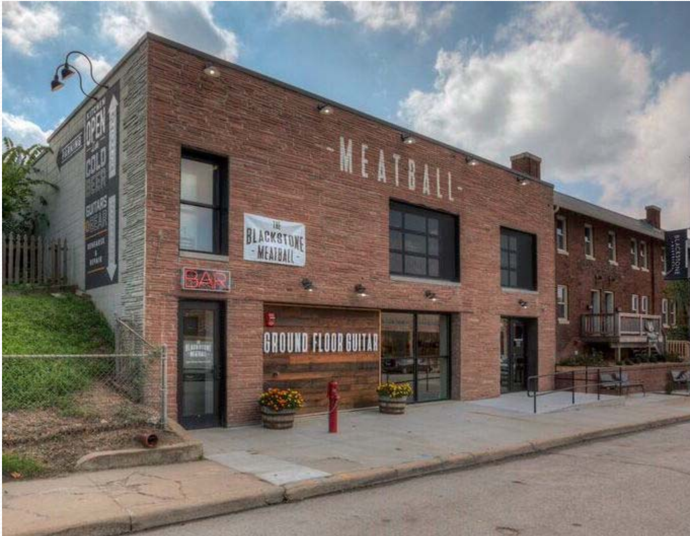
BD3 – 39 th & Farnam